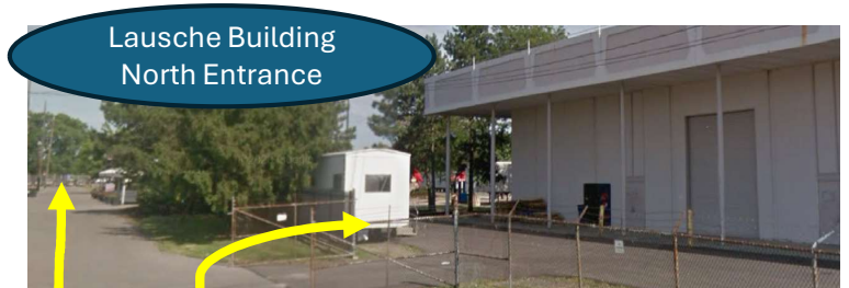
Student Drop Off. Keep going straight for Long Term Parking (make LEFT on Maco Avenue) just ahead.