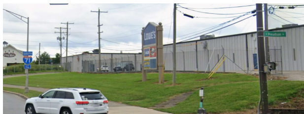
Turn onto Silver Drive from Hudson Street (Lowe's sign)