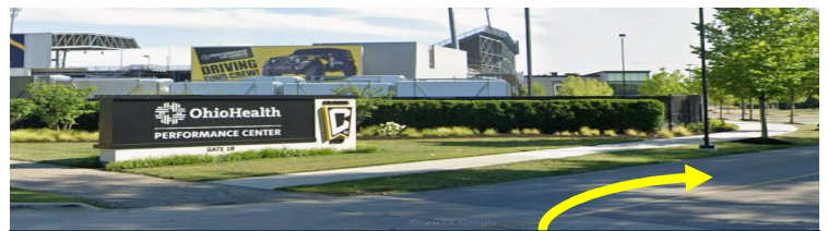
Turn RIGHT onto E. 20 th Avenue from Silver Dr. (OhioHealth Performance Center sign).