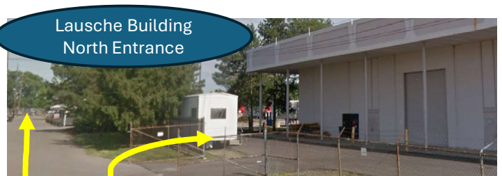
Bus Drop Off, Turn RIGHT into Fence Opening for Short-Term Parking and Park on back of building. Keep going straight and turn left on Maco Ave for Long Term Parking