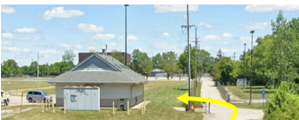
Stay on 20 th Avenue, turn LEFT just past the gate house