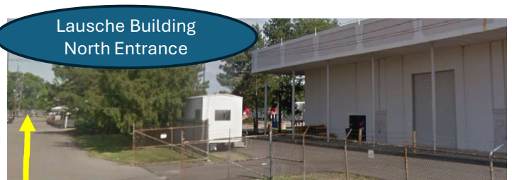
Drove straight past the Lausche Building. Keep going straight and turn left on Maco Ave for Long Term Parking