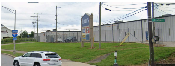
Turn onto Silver Drive from Hudson Street (Lowe's sign)