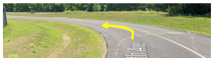
Stay on 20 th Avenue, heading left around the bend