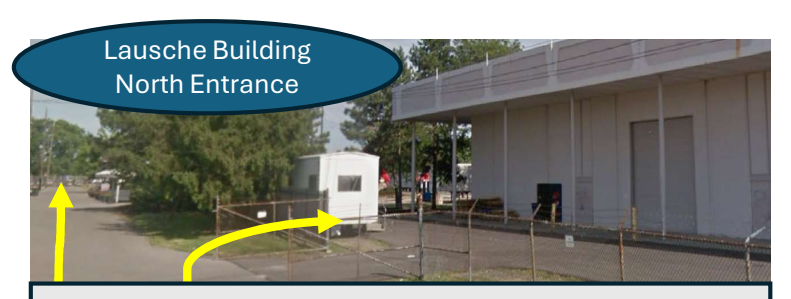
Student Drop Off. Keep going straight for Long Term Parking (make LEFT on Maco Avenue) just ahead.