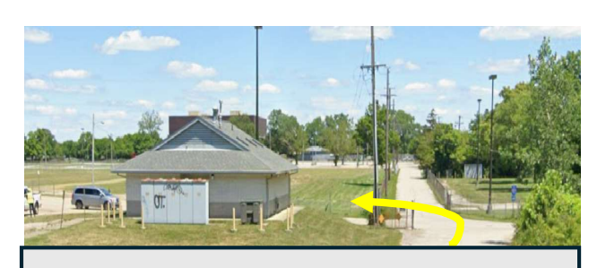
Stay on 20<sup>th</sup> Avenue, turn LEFT just past the gate house